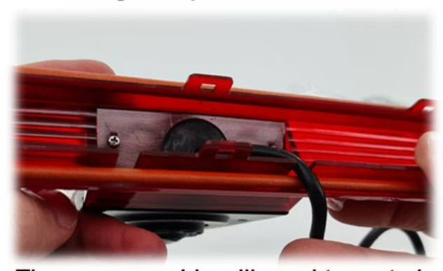
The camera cable will need to route in one of the two cutouts at the bottom