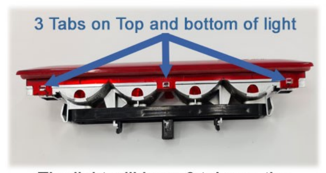
The light will have 3 tabs on the top and 3 on the bottom