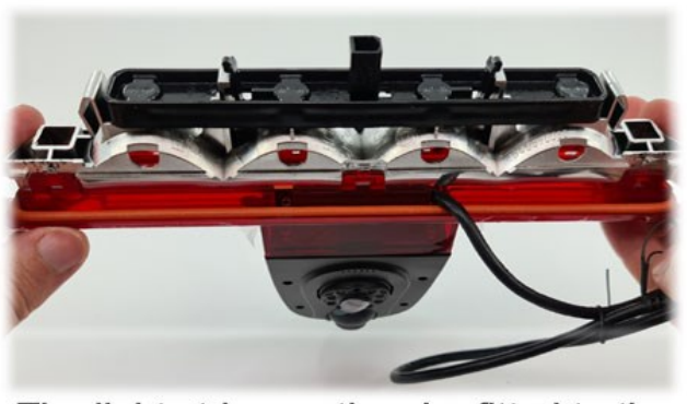
The light strip can then be fitted to the camera, then screwed on to vehicle