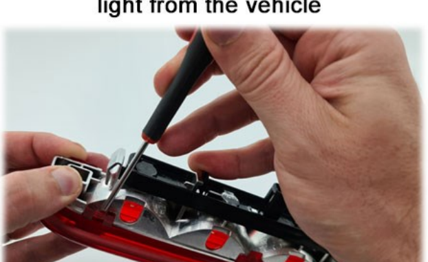
Carefully lever these up to release the light strip from the red lens