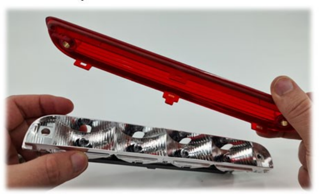
The red lens will come away leaving the light strip ready to transplant