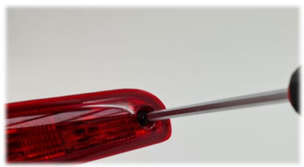
Unscrew the original light from the vehicle

The pictures below show the removal and refitting of your existing light strip from the old brake light to the new reversing camera housing.